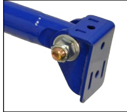
Weld-on frame brackets (2-3/4" tall) match Mustang and Nova rail height. Must be trimmed for shorter rail height of Falcons.