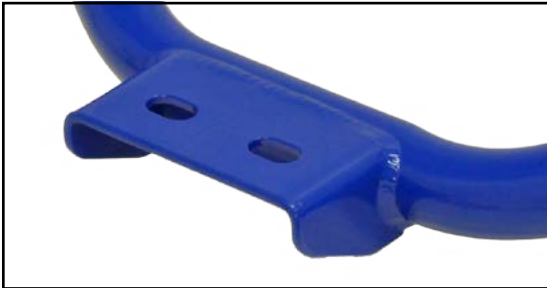
Crossmember bracket fits GM-style aftermarket urethane mounts.