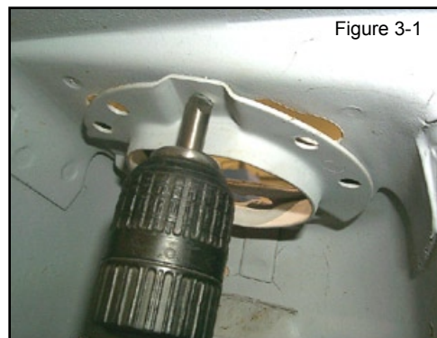
Figure 3-1 applies only to vehicles using carriage bolts to secure the factory upper shock mount.

Note: Fairlane shock towers use a slightly different bolt pattern and must be drilled to match the adapter and backup plates. Structural integrity is maintained through use of the backup plate.