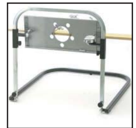
Bump Steer Gauge