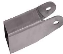
5322 & 5323 - Engine Mount Frame Adapter