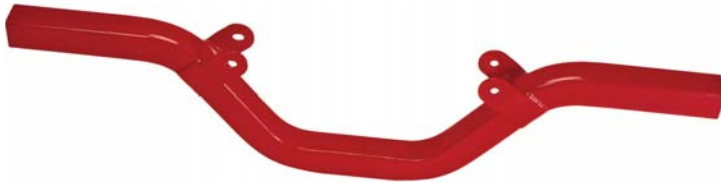
6060 - Billet-Mount Engine Crossmember

Custom-Fit Installations - The mount can be bolted to the engine block in either direction for greater flexibility in positioning the engine crossmember or frame adapters.