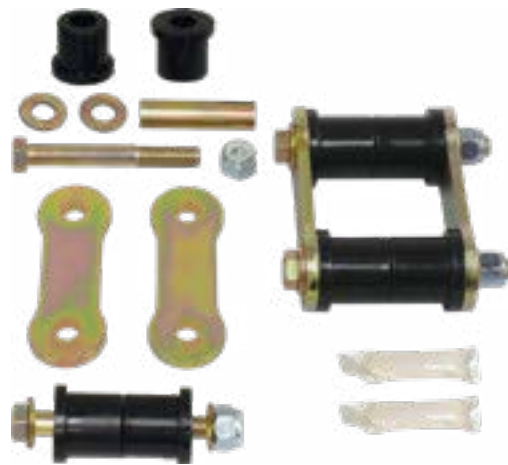
TCP LSP-05 - Rear-Eye Shackle Set