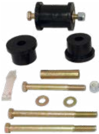
TCP LSP-04 - Front-Eye Bushing Set

* Items can also be purchased separately.