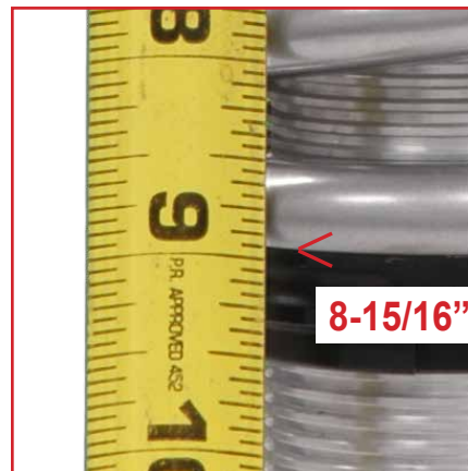
Measure the bottom end of the spring.