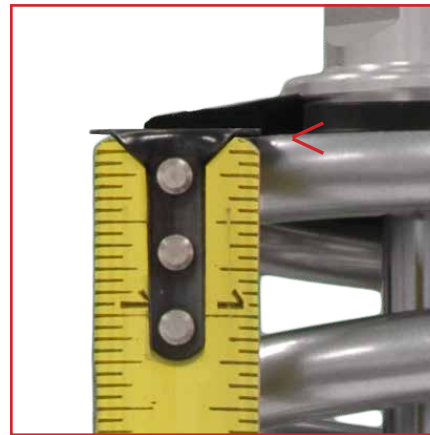
Hook the tape measure against the spring at the upper spring seat slot.